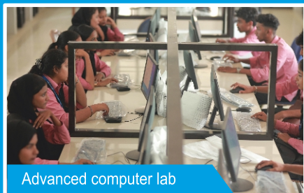
Advanced computer lab