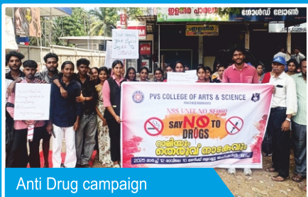
Anti Drug campaign

Follow us: f /pvscollege @ /pvs_college_pkv