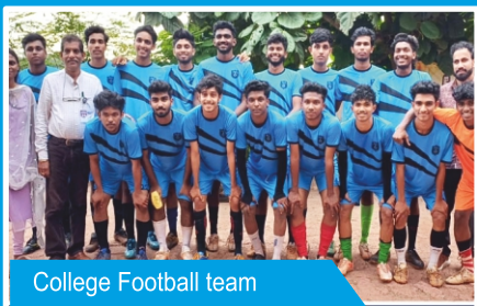
College Football team