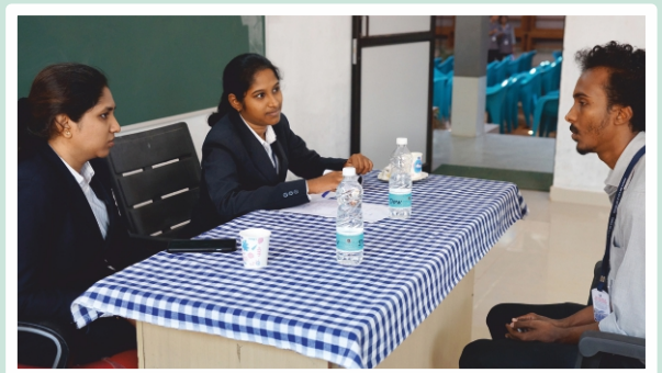
Campus Placement Drive