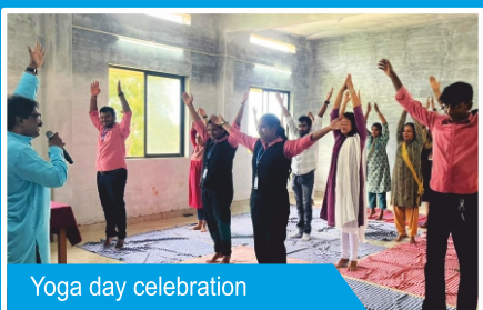
Yoga day celebration