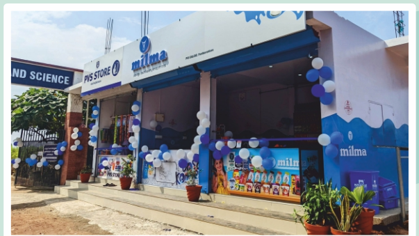
PVS Store & MILMA Parlour