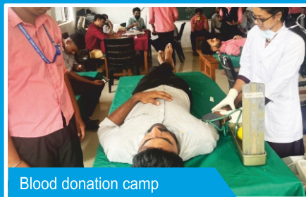
Blood donation camp