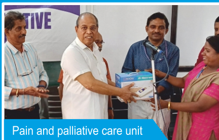
Pain and palliative care unit