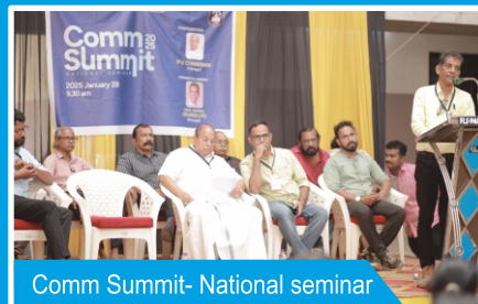
Comm Summit- National seminar