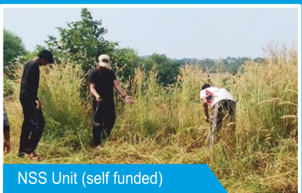
NSS Unit (self funded)